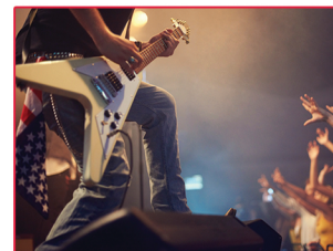
FESTIVALS & CONCERTS