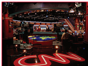
CNN WORLD HEADQUARTERS

HOME TO EXCITING ATTRACTIONS & MORE THAN A DOZEN FORTUNE 500 COMPANIES!