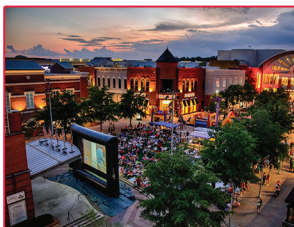
FANTASTIC SHOPPING CENTERS