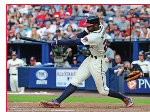
ATLANTA BRAVES BASEBALL

NONSTOP FLIGHTS TO MORE THAN 150 U.S. DESTINATIONS INCLUDING MIAMI, NEW YORK CITY, AND WASHINGTON, D.C.