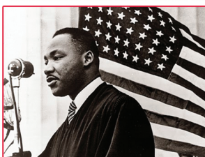
MARTIN LUTHER KING, JR. SITE